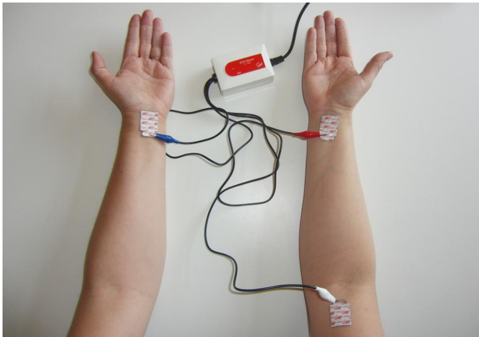
Connection of the EKG sensor to the body.